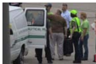
Possible Meth Lab in Forest Park Jun 22, 2011